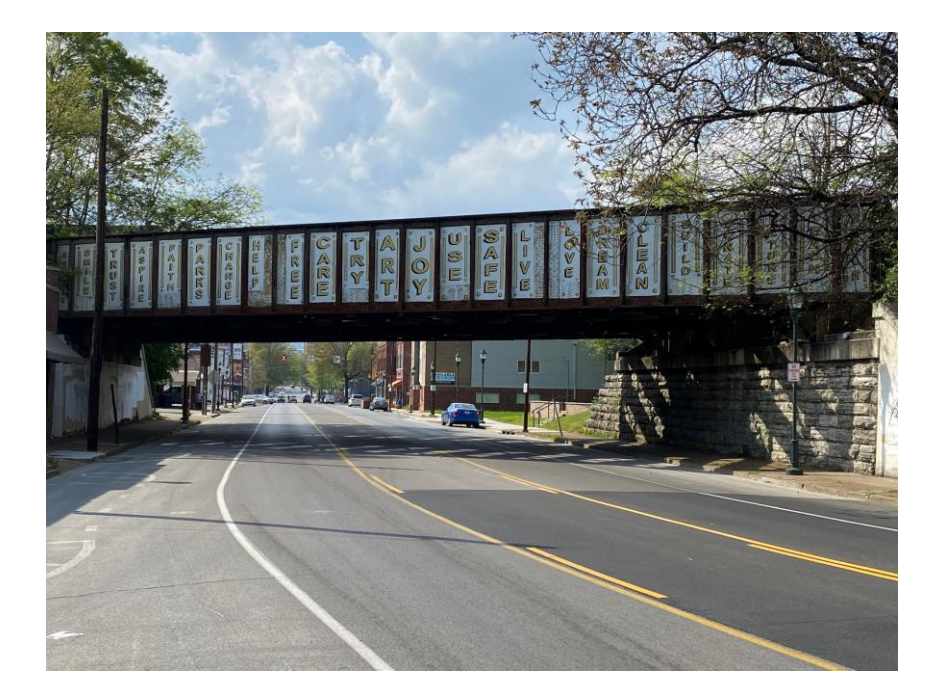
EXHIBIT D ARTWORK SITE DIAGRAM